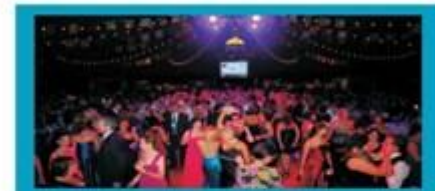
2010 Zig Zag Foundation Gala Ball with your help we raised approximately